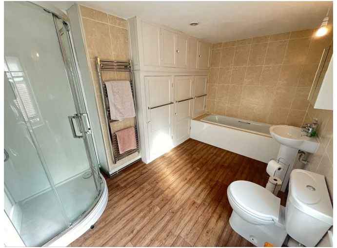
Bathroom 12'8" x 7'3" (3.87m x 2.23m)

Sizeable bathroom fitted with a four piece suite consisting of a bath with cream tile surround, pedestal sink, w.c. and glass corner shower cubicle. Wood effect flooring, towel radiator, glass panel window above door, single glazed sash privacy glass window, radiator, wall mounted mirror front cabinet and extractor. The room benefits from multiple storage cupboards including a cupboard housing the 'Glow-worm' combination boiler.