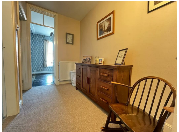
Staircase up to Landing

With loft access hatch, radiator and ample room for furniture.