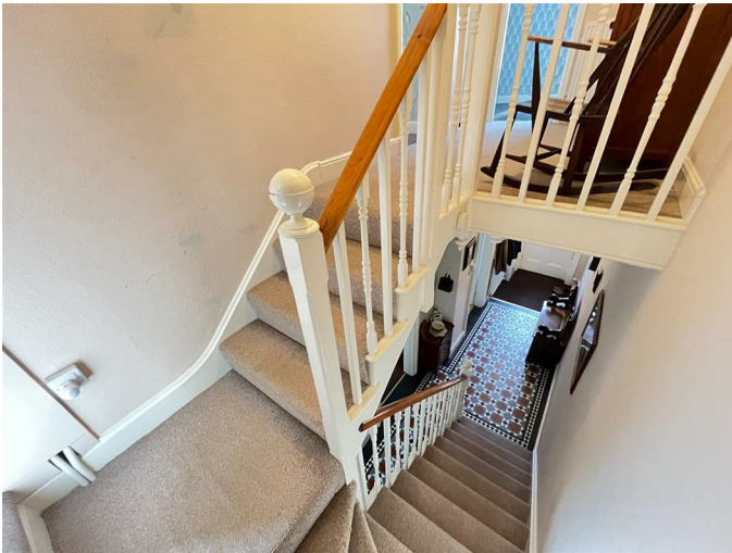
First Floor Half Landing

Galley style kitchen with high gloss wall, base and drawer units with contrasting slate worktop. Integrated electric oven with 4 ring gas burner and extractor over, stainless steel sink unit with drainer, space and plumbing for a washing machine, tumble dryer and fridge freezer. There is a uPVC double glazed window and glass panelled door, single glazed window, radiator, small consumer unit, tiled splashbacks and wall recess with shelving.