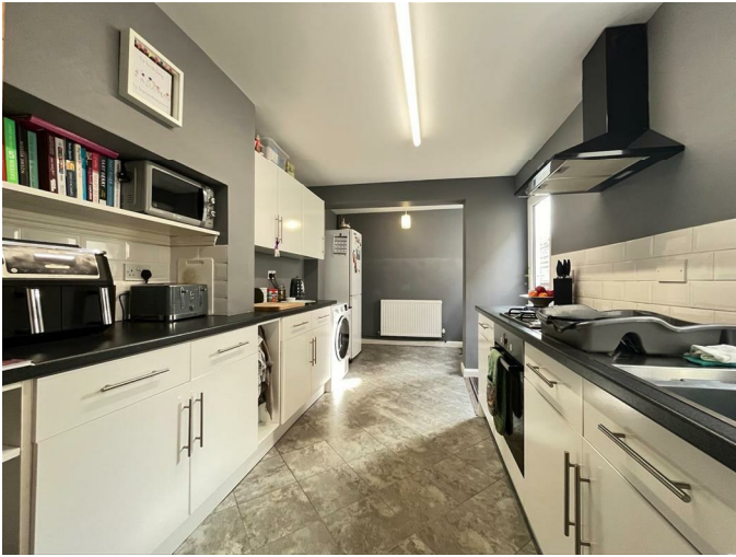
Kitchen 17'10" x 8'4" (5.45m x 2.55m)

Galley style kitchen with high gloss wall, base and drawer units with contrasting slate worktop. Integrated electric oven with 4 ring gas burner and extractor over, stainless steel sink unit with drainer, space and plumbing for a washing machine, tumble dryer and fridge freezer. There is a uPVC double glazed window and glass panelled door, single glazed window, radiator, small consumer unit, tiled splashbacks and wall recess with shelving.